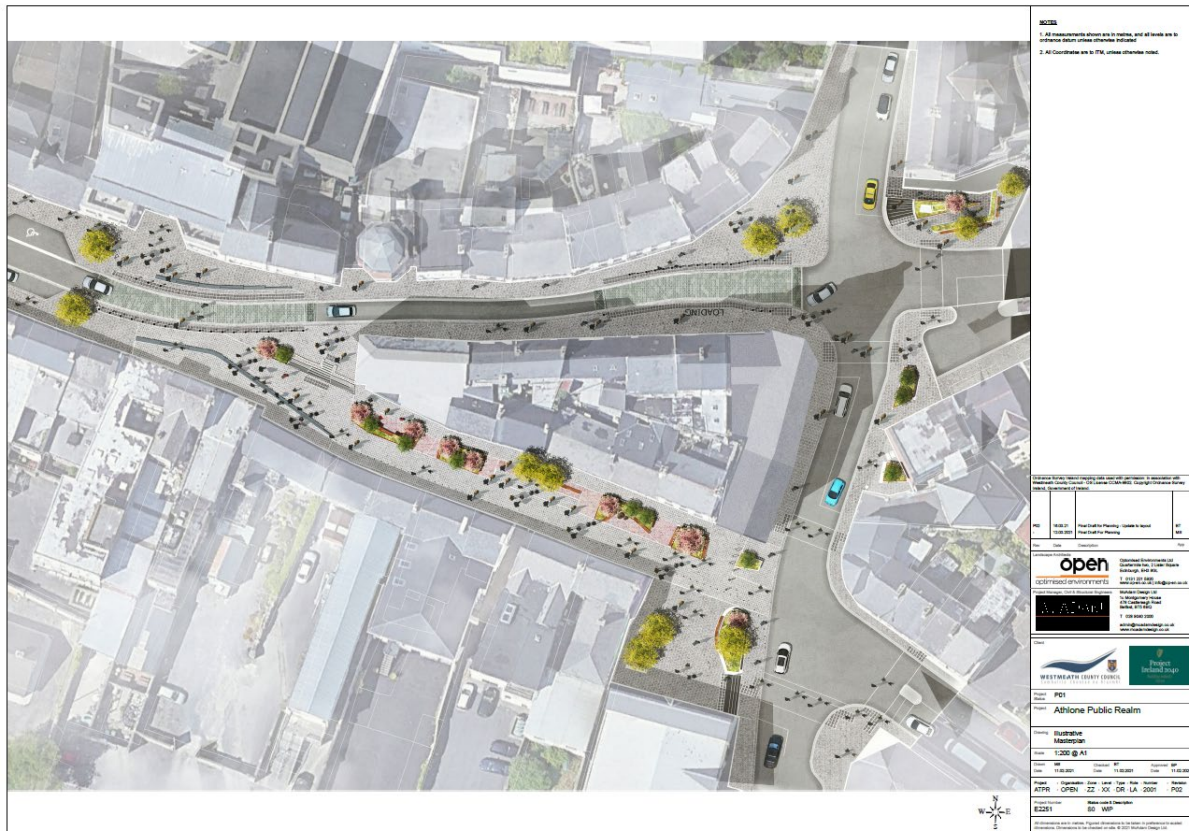
Figure 2: Illustrative Map of Proposed Works