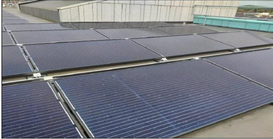
Figure 1: Example of Solar PV Panels with a Flat Roof Mounting System

Panels will be approximately 1m X 1.7m in size and will be mounted very close to the roof surface level, at a 10° tilt. The parapet wall along the roof rises to approximately 350mm with approximately a 2m offset of the panel from the roof edge, therefore the panels will not be visibly intrusive on the existing building.