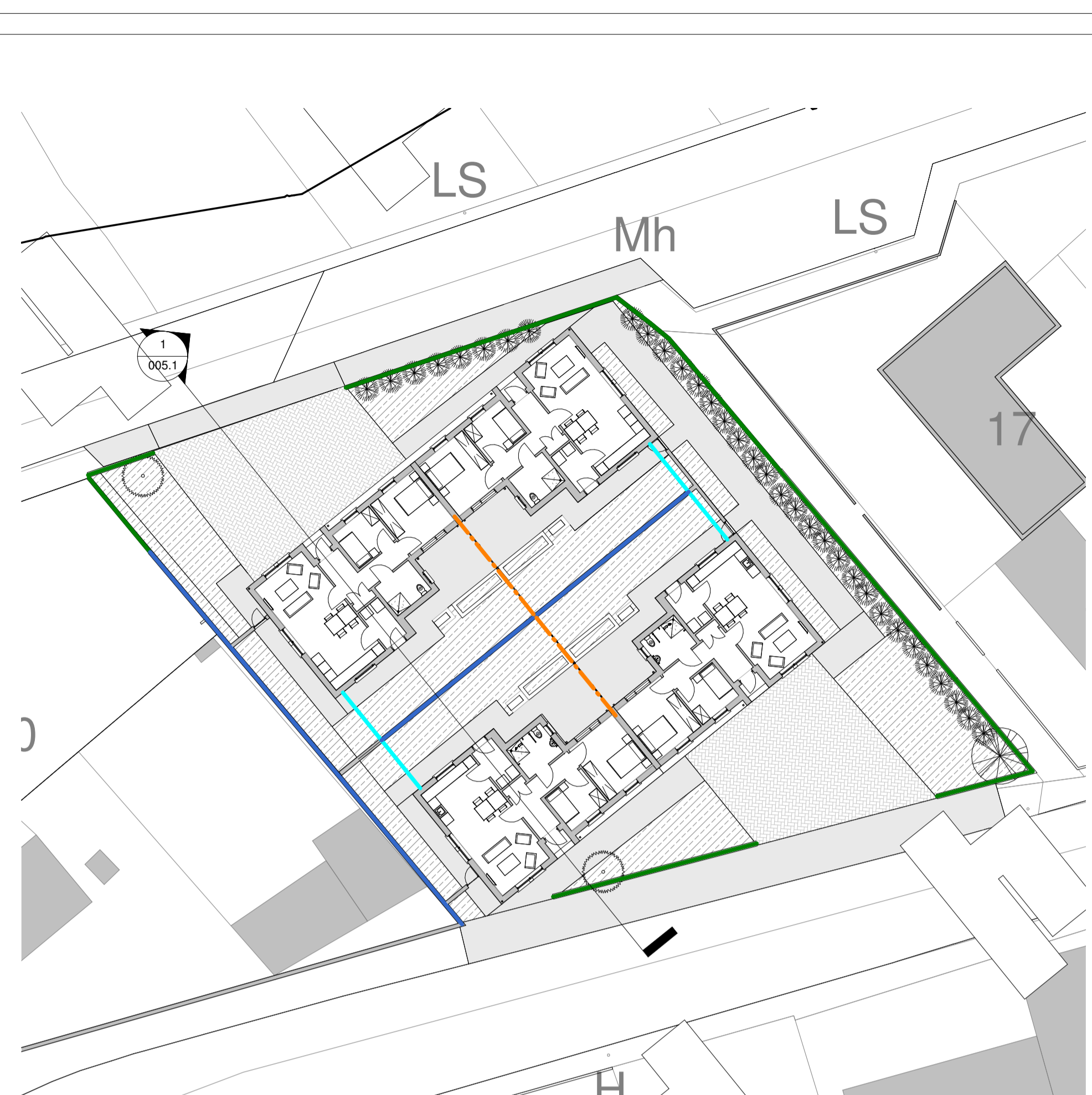
3 Site Boundary Treatment Site 3 1 : 250