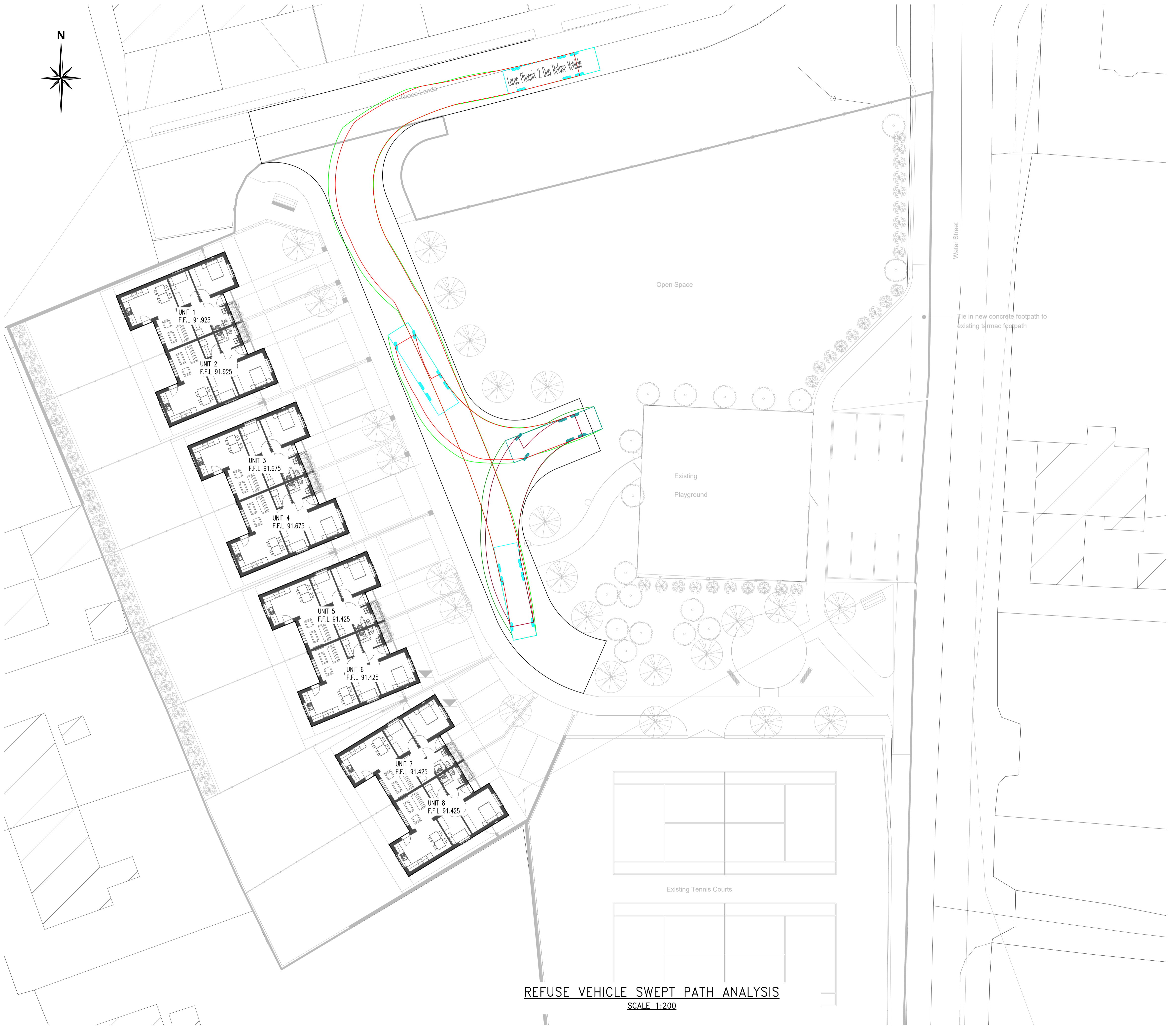
REFUSE VEHICLE SWEEP PATH ANALYSIS SCALE 1:200