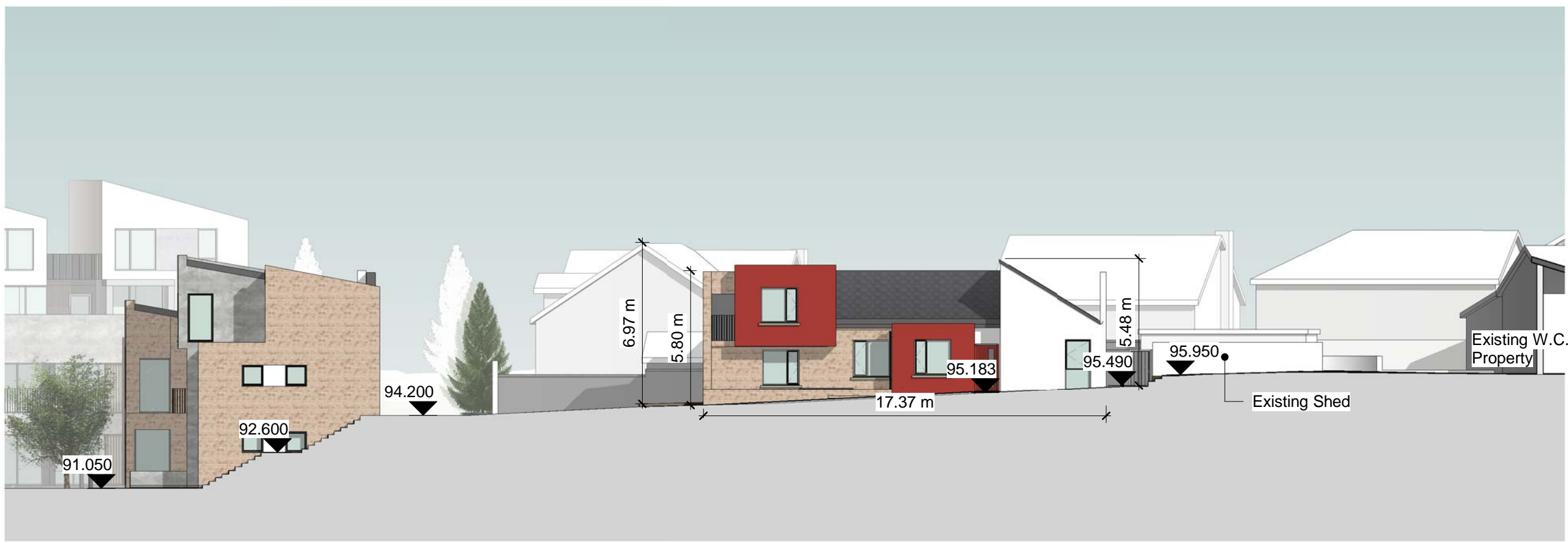
3 Cross Section through Pedestrian Access showing Units 31 & 32 1 : 200