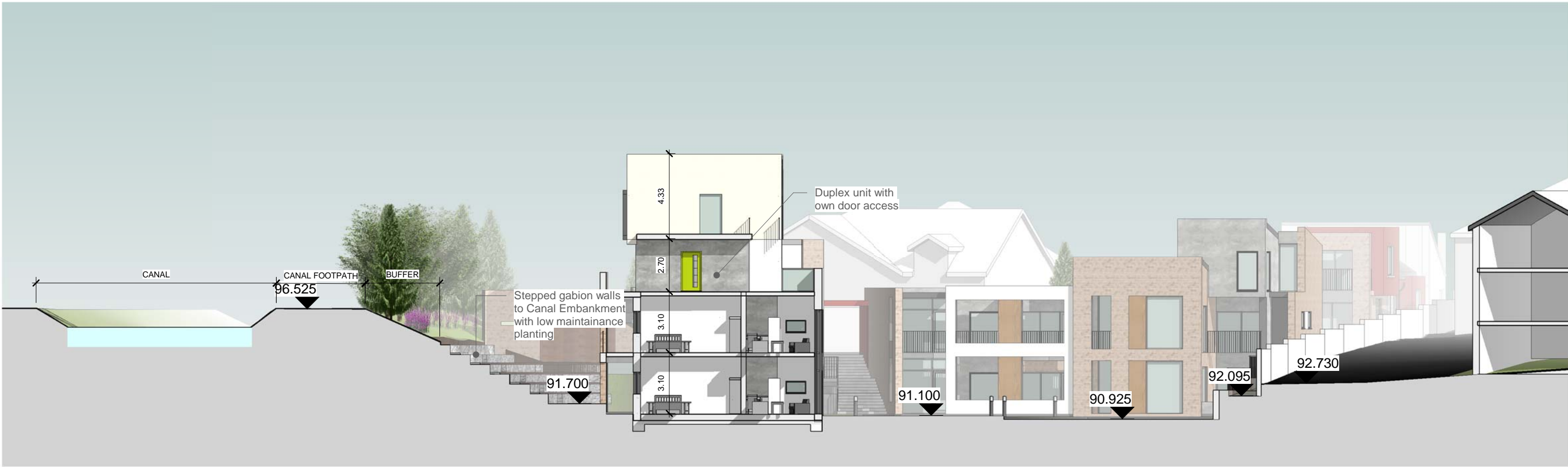
4 Cross Section through Site 1 : 200

This Drawing is to be read in conjunction with the relevant Floor Plans, Particular Specification.