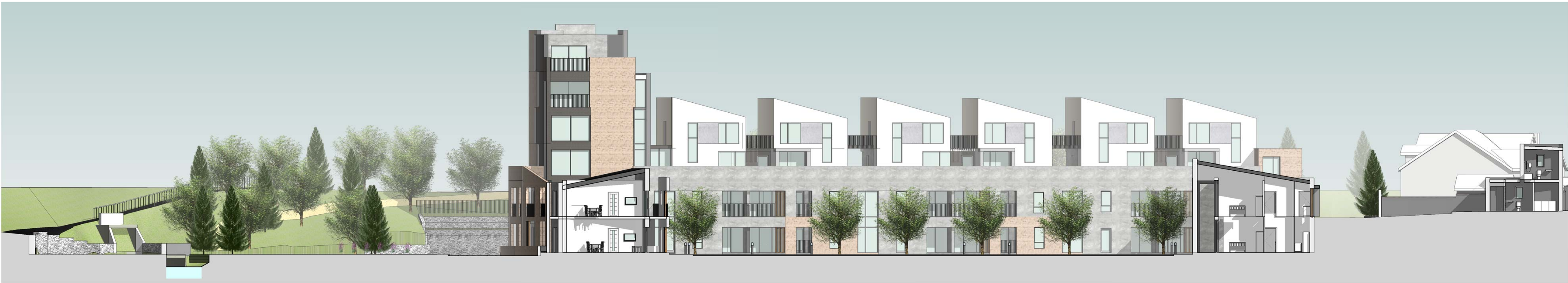
1 Longitudinal Section Through Site showing Main Apartment Block 1 : 200