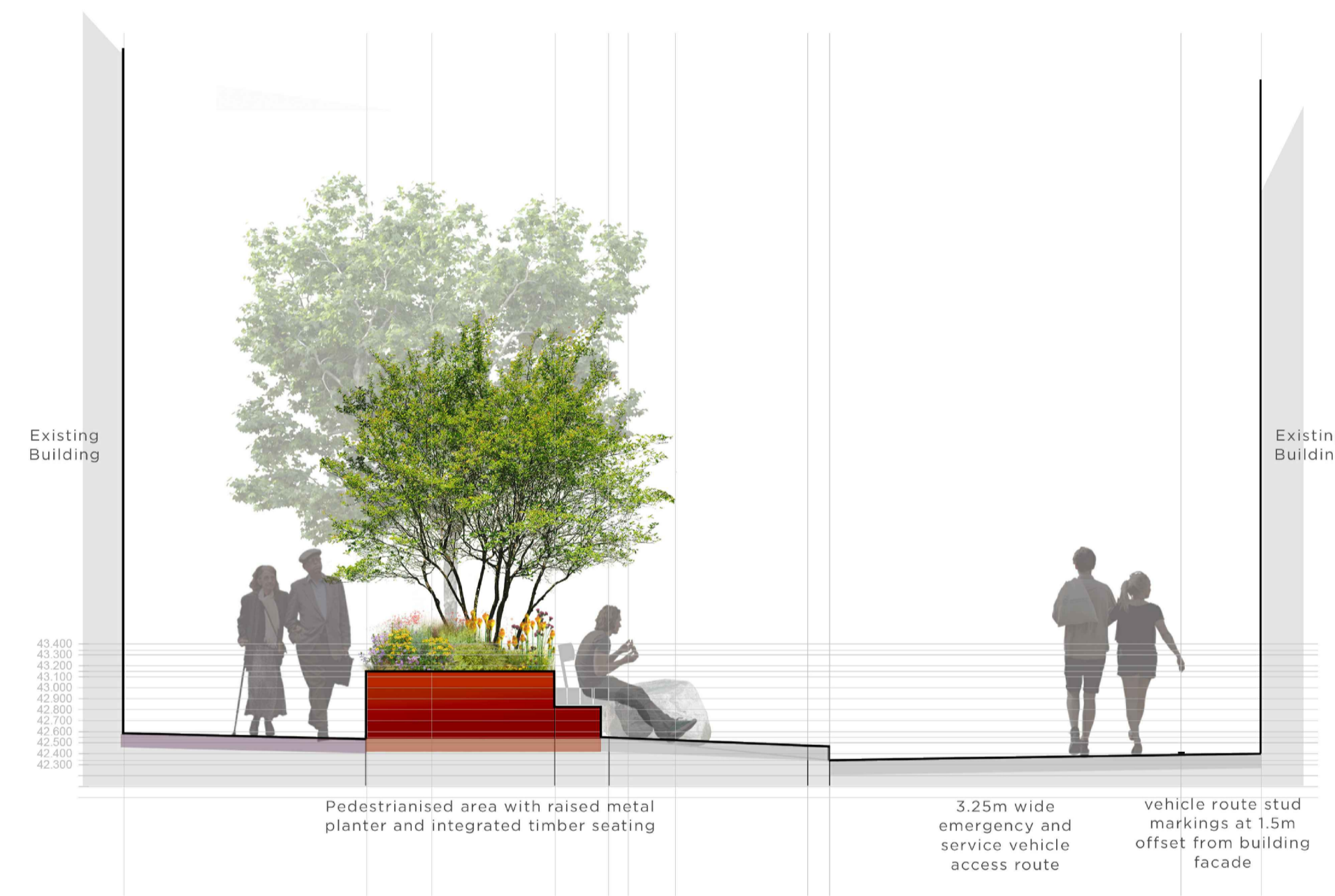
Section 3: Street Section through Sean Costello Street