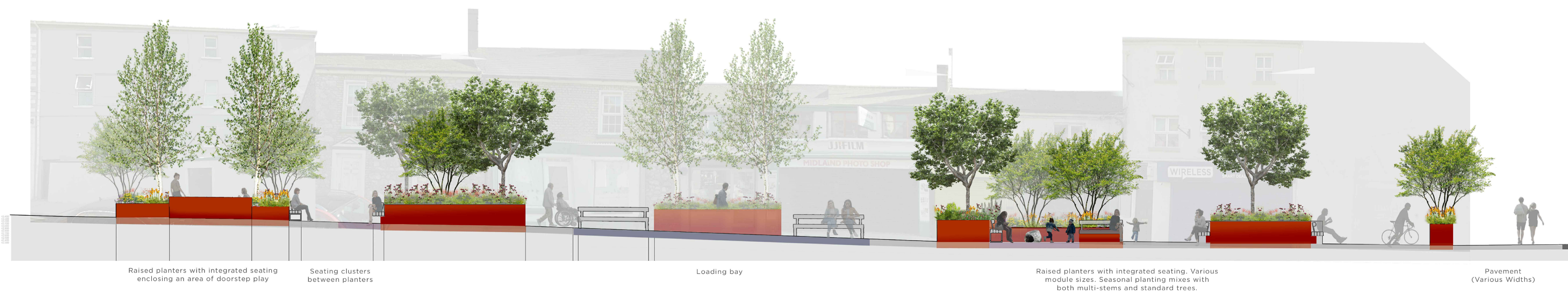
Section 4: Long Section along Sean Costello Street