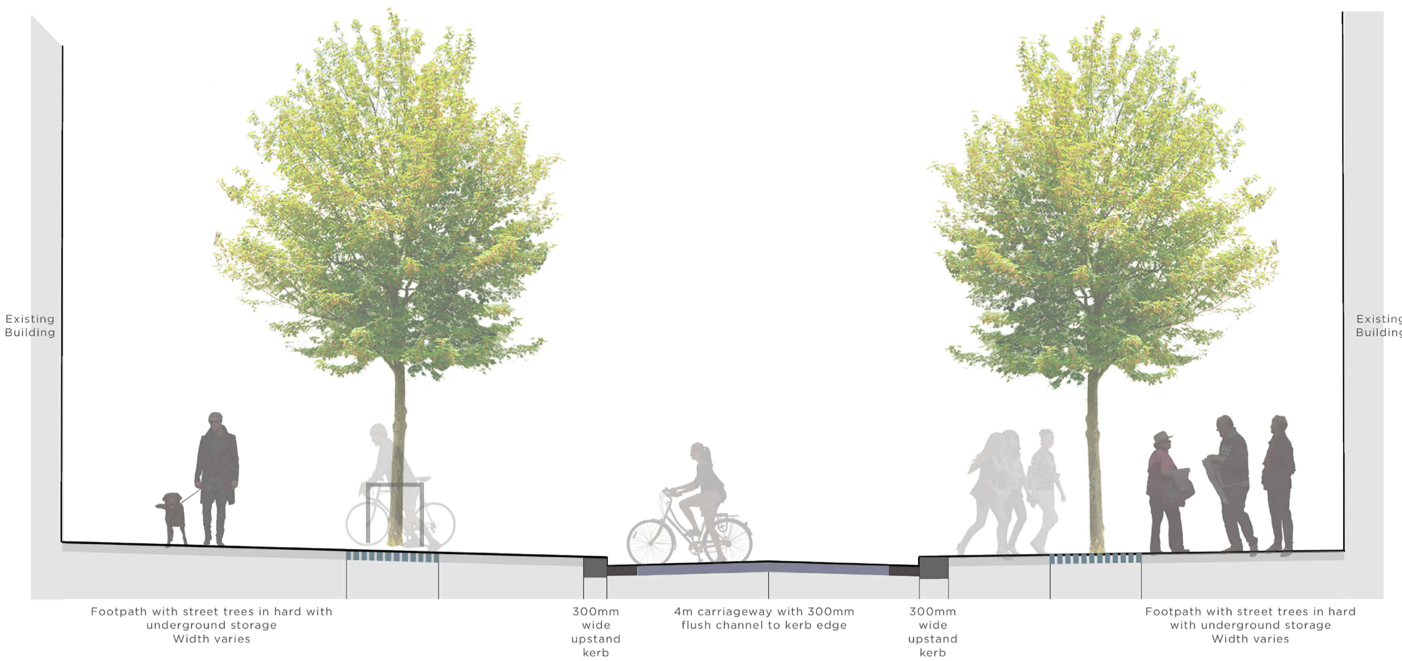
Section 2: Section through Dublin Gate Street