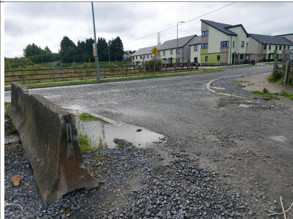
Proposed entrance, looking west