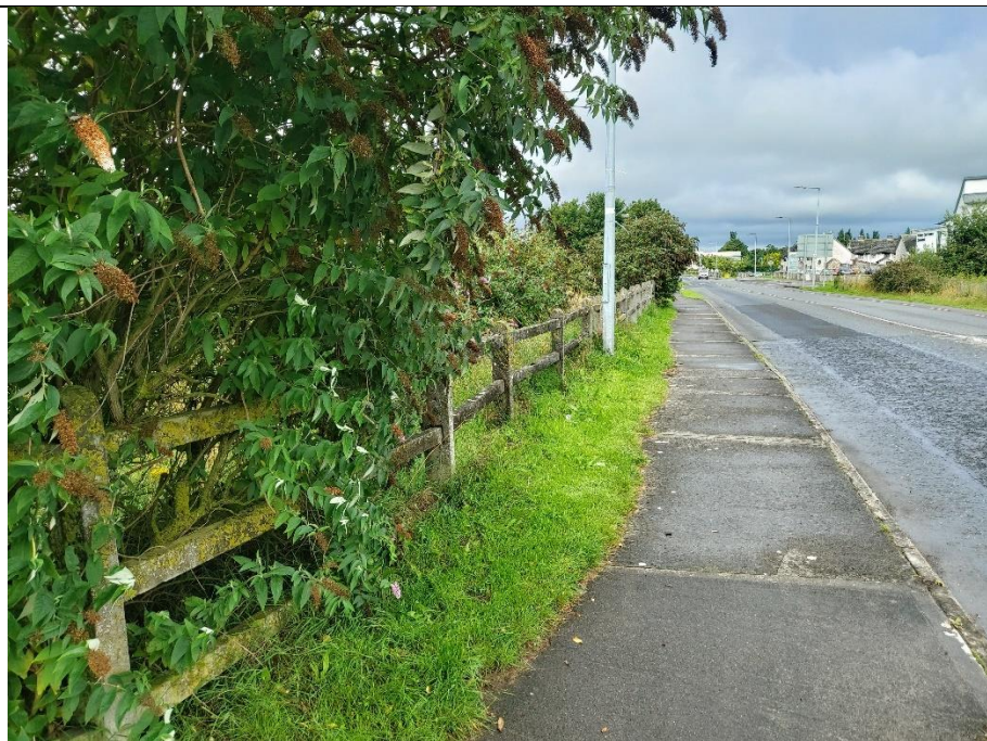
View of northern boundary from inside the site