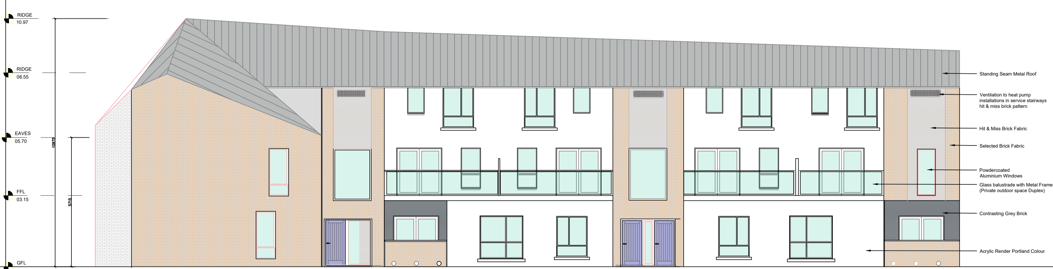
WEST ELEVATION (INTERNAL COURTYARD) - DUPLEX OVER APARTMENT UNITS TYPE 5 & 6