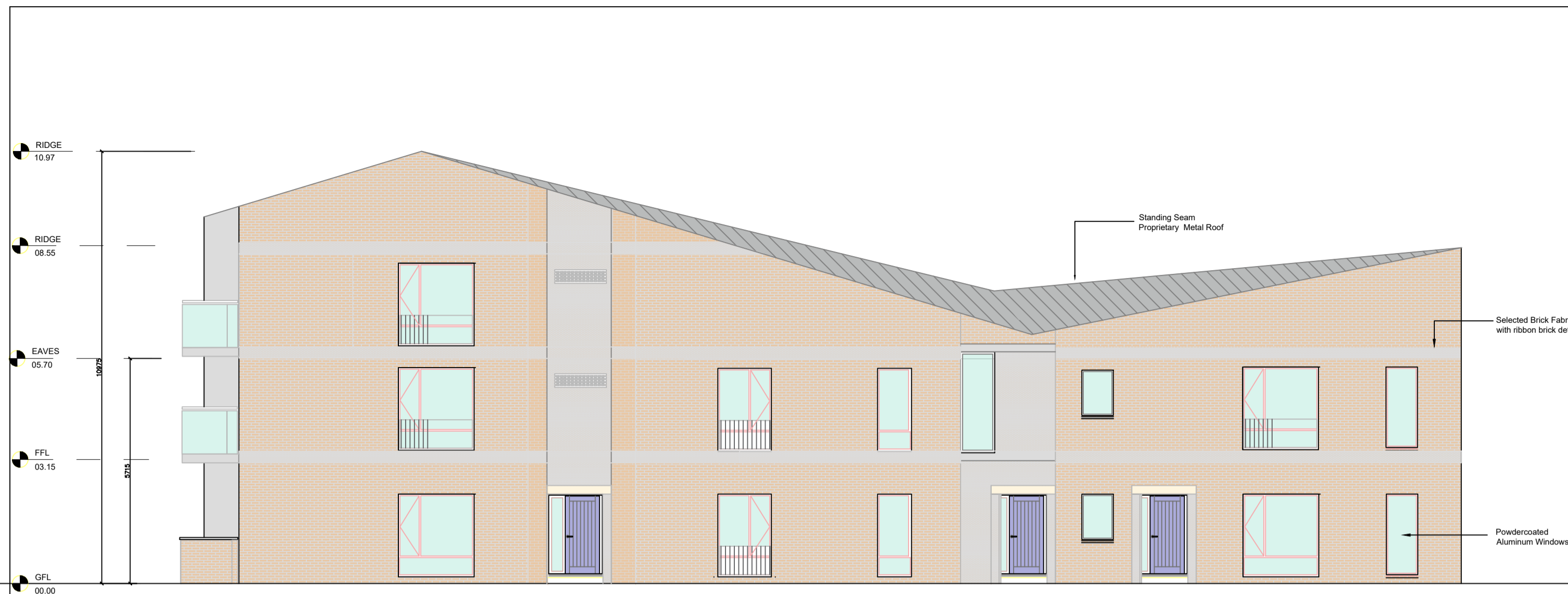
NORTH ELEVATION (ROAD SIDE) - APARTMENT BUILDING