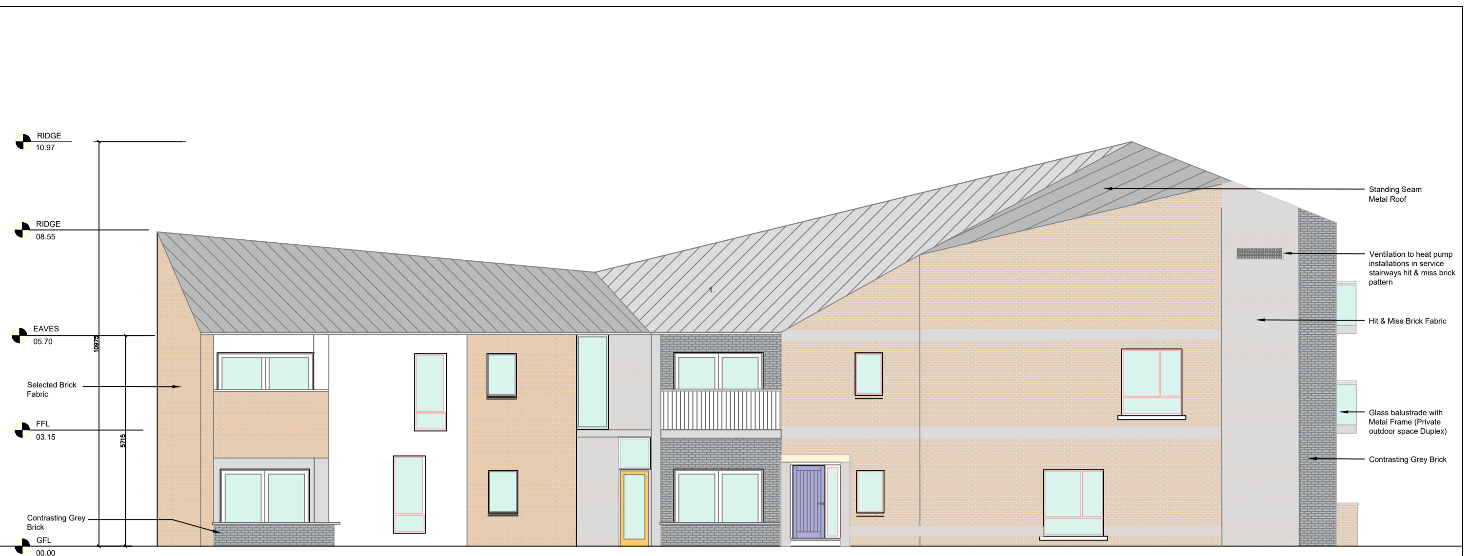
SOUTH ELEVATION (INTERNAL COURTYARD) - APARTMENT UNITS TYPES 7-9