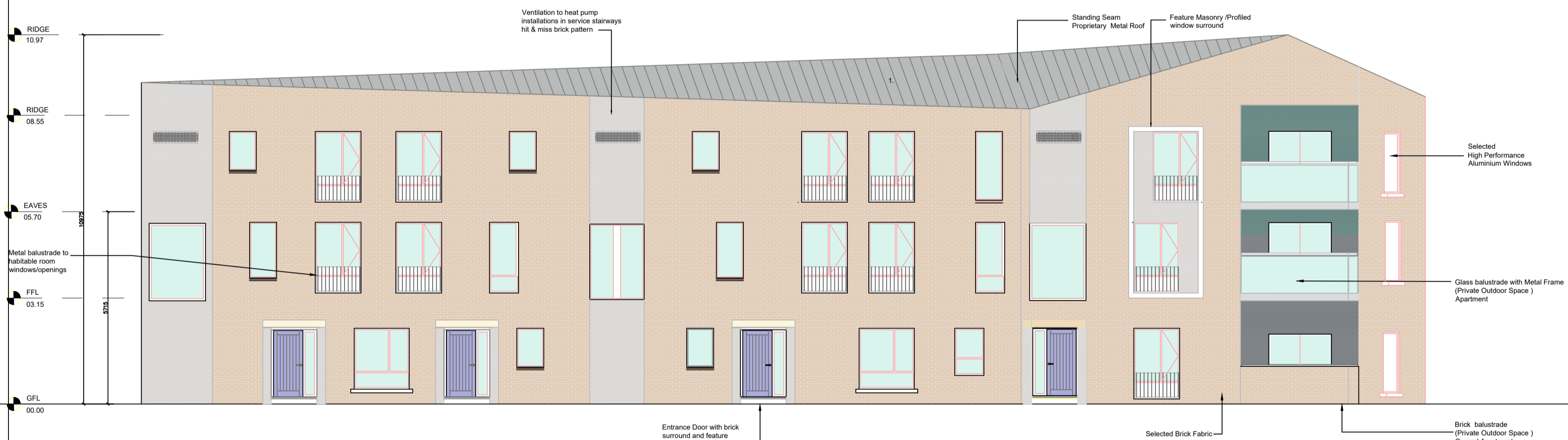
EAST ELEVATION (ROAD SIDE) - APARTMENT BUILDING