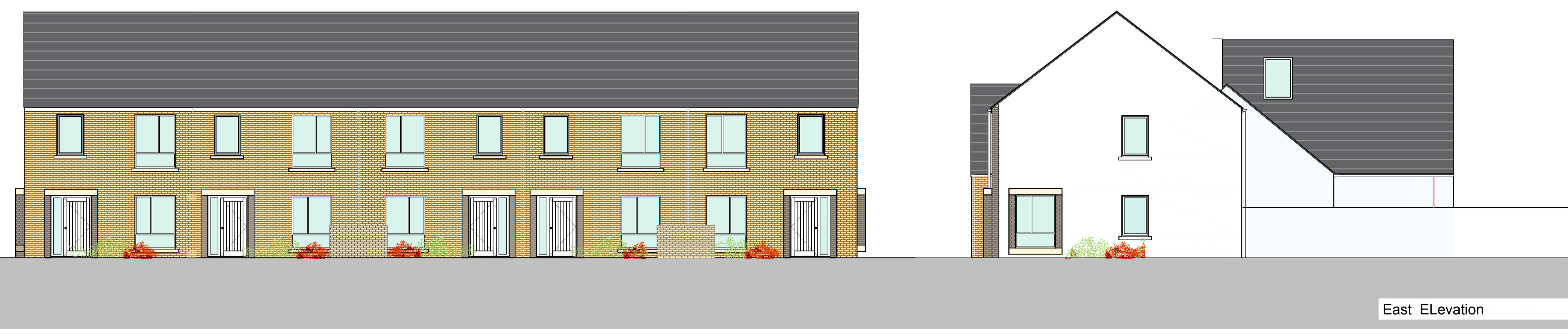
4 End of Terrace Contextual Elevation Site 1:100

FILE NAME AND DIRECTORY: 116_02_009_House Type 4_Elevations.dwg H\CAPITAL HOUSING DESIGN TEAM\Capital Schemes\116-Arcadia Phase 2\Drawings\PART 8\HOUSES