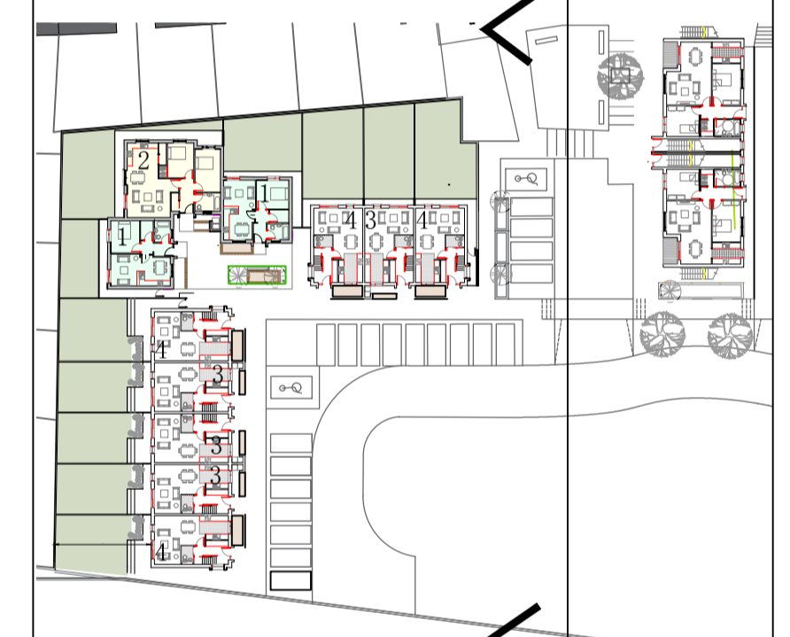
End of Terrace Arrangement Site PART 8