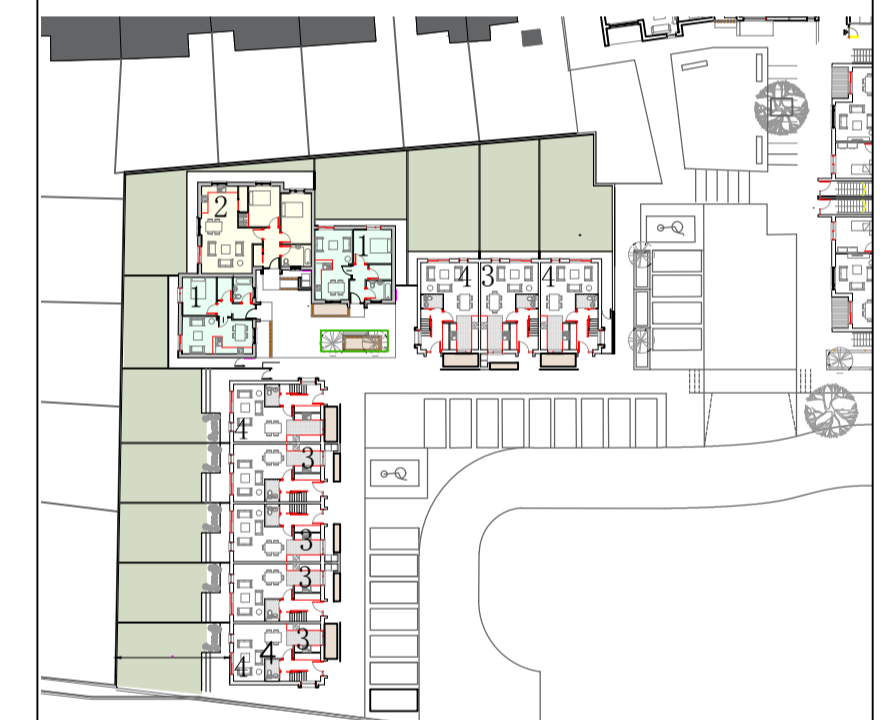
End of Terrace Arrangement Site PART 8