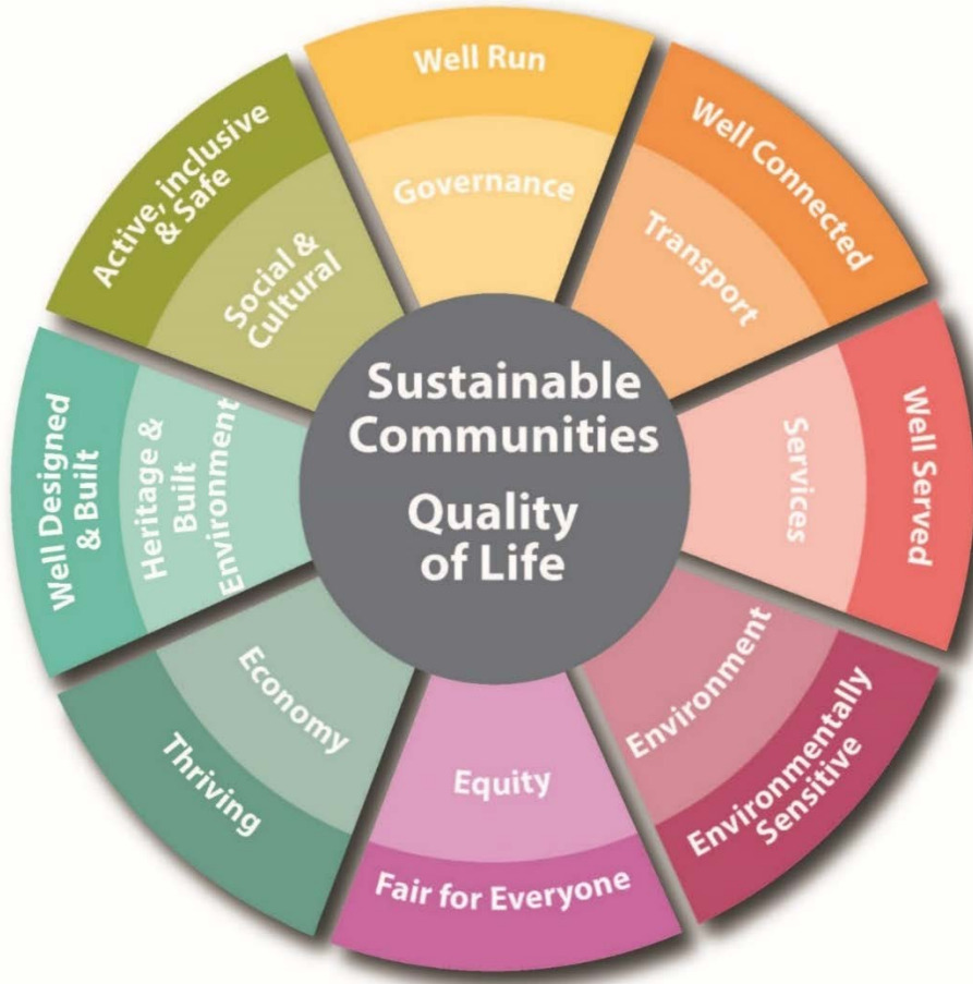
Figure 4.1: Elements of sustainability and quality of life.