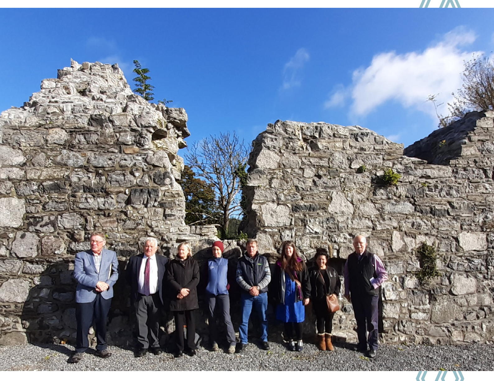
Some of the members of the Westmeath Heritage Forum at the Old Gaol in Fore, 2022 \,