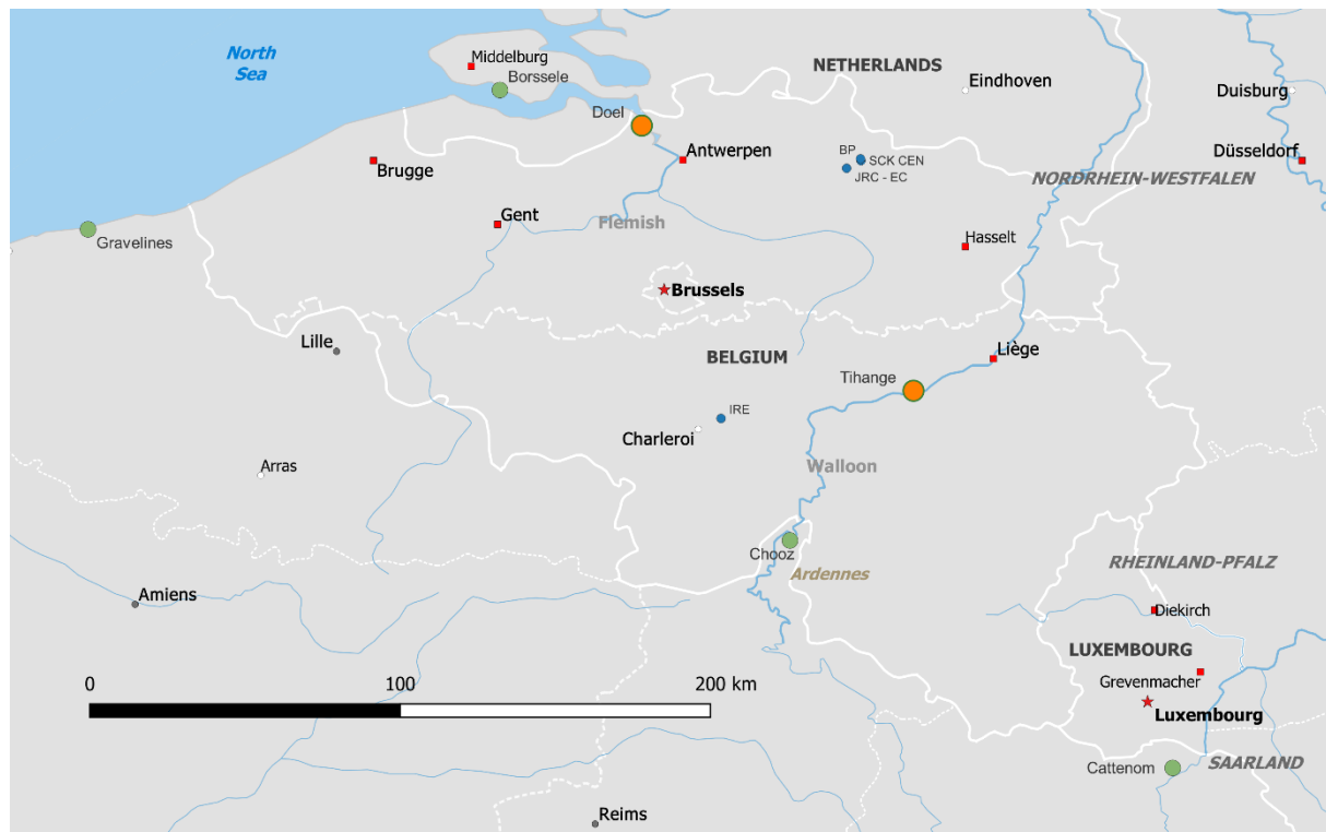
Figure 1: Location of the Doel and Tihange nuclear power plants (orange), the nuclear power plants on Belgium's borders (green) and other Class 1 nuclear facilities in Belgium (blue).

Doel 4 and Tihange 3 are respectively part of the site of the Doel nuclear power plant (Kerncentrale Doel - KC Doel), located along the Scheldt, at Scheldemolenstraat, Haven 1800, 9130 Doel, and of the site of the Tihange nuclear power plant (Centrale Nucléaire de Tihange, CN Tihange), located along the Meuse, at Avenue de l'Industrie 1, 4500 Huy (Figure 1), and are operated by Electrabel SA.