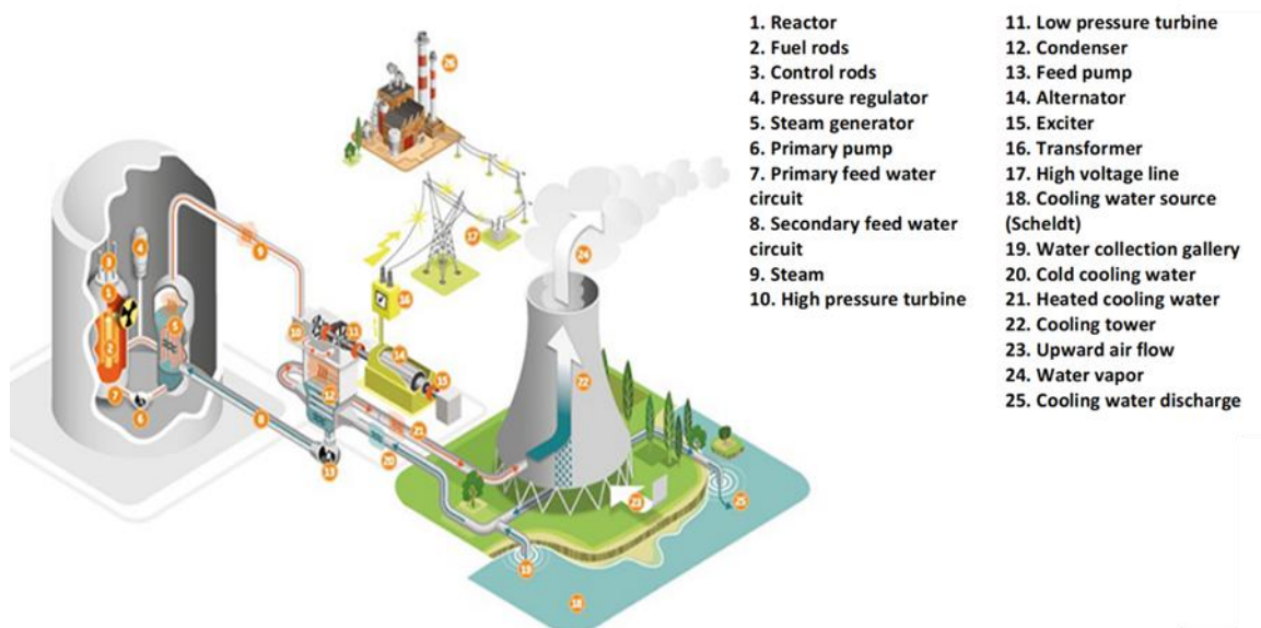
Figure 2: Operation of the nuclear power plant with, from left to right, the reactor building, the machine room and the cooling circuit.

Doel 4 and Tihange 3 are reactors of the so-called pressurised water type (PWR - Pressurised Water Reactor). Such a reactor is typically composed of three compartments with three separate circuits: the reactor building with primary circuit, the machine room with secondary circuit and the cooling circuit forming the tertiary circuit (Figure 2).