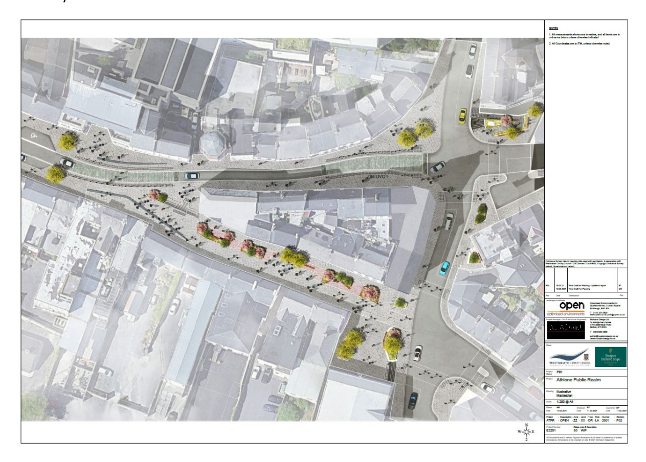
Figure 2: Illustrative Map of Proposed Works