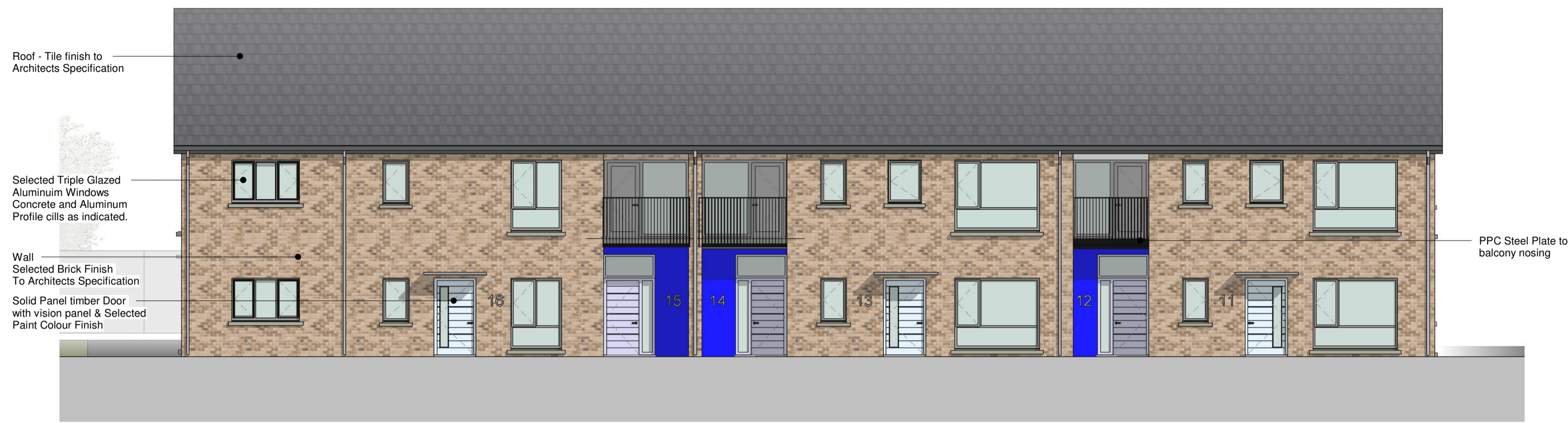
2 Elevation 2 1 : 100