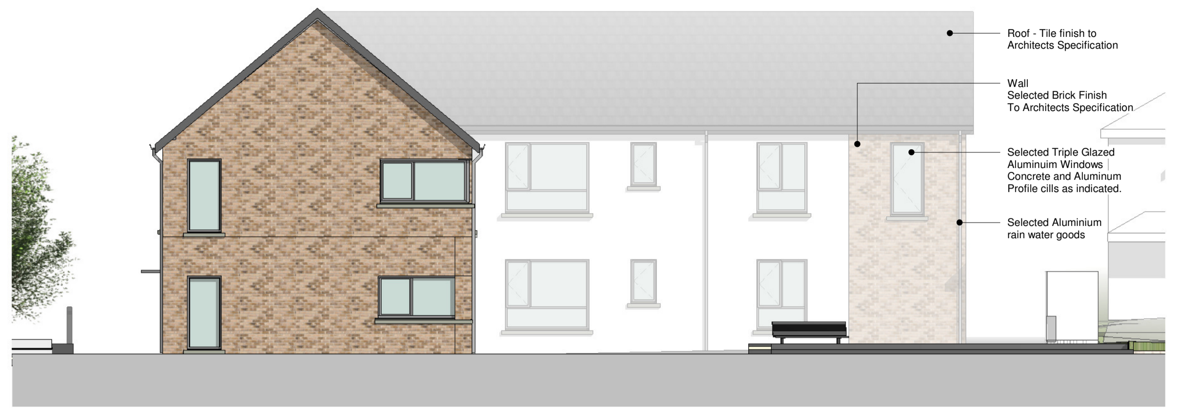
1 Elevation 1 1 : 100