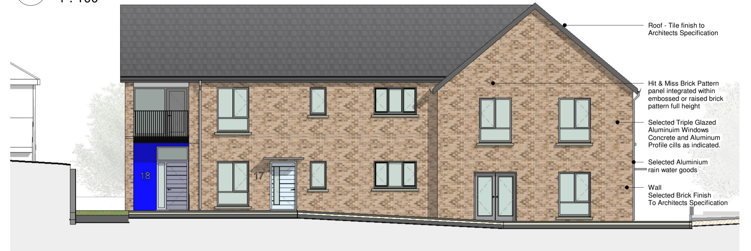
3 Elevation 3 1 : 100