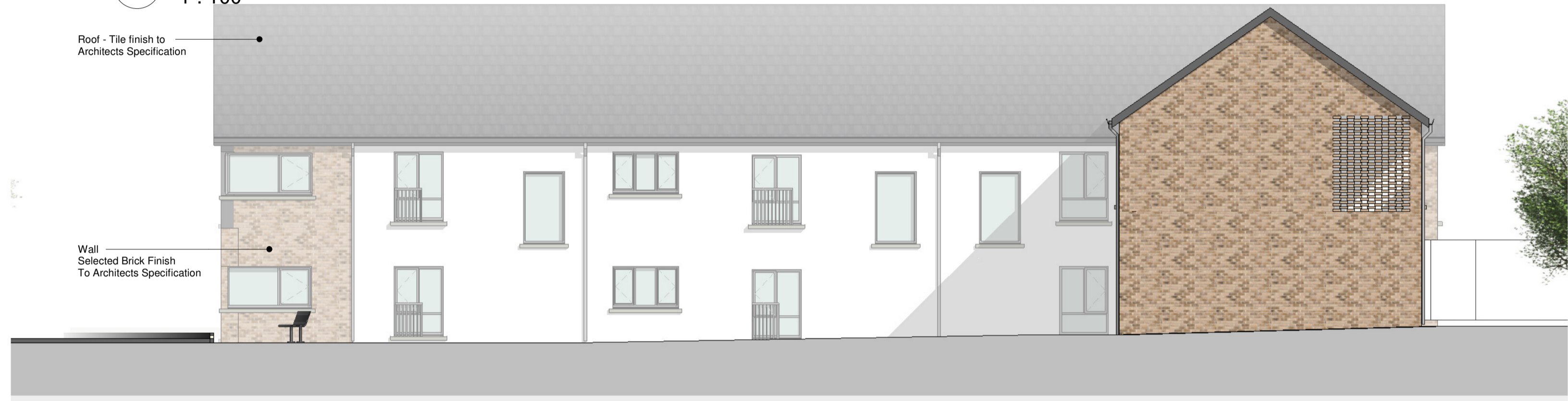
4 Elevation 4 1 : 100