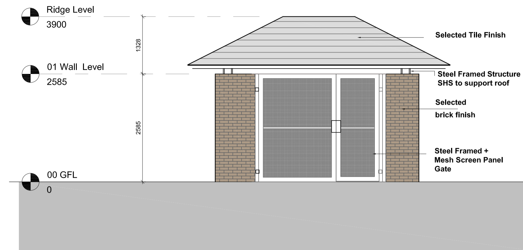
4 Front View Elevation 1:50