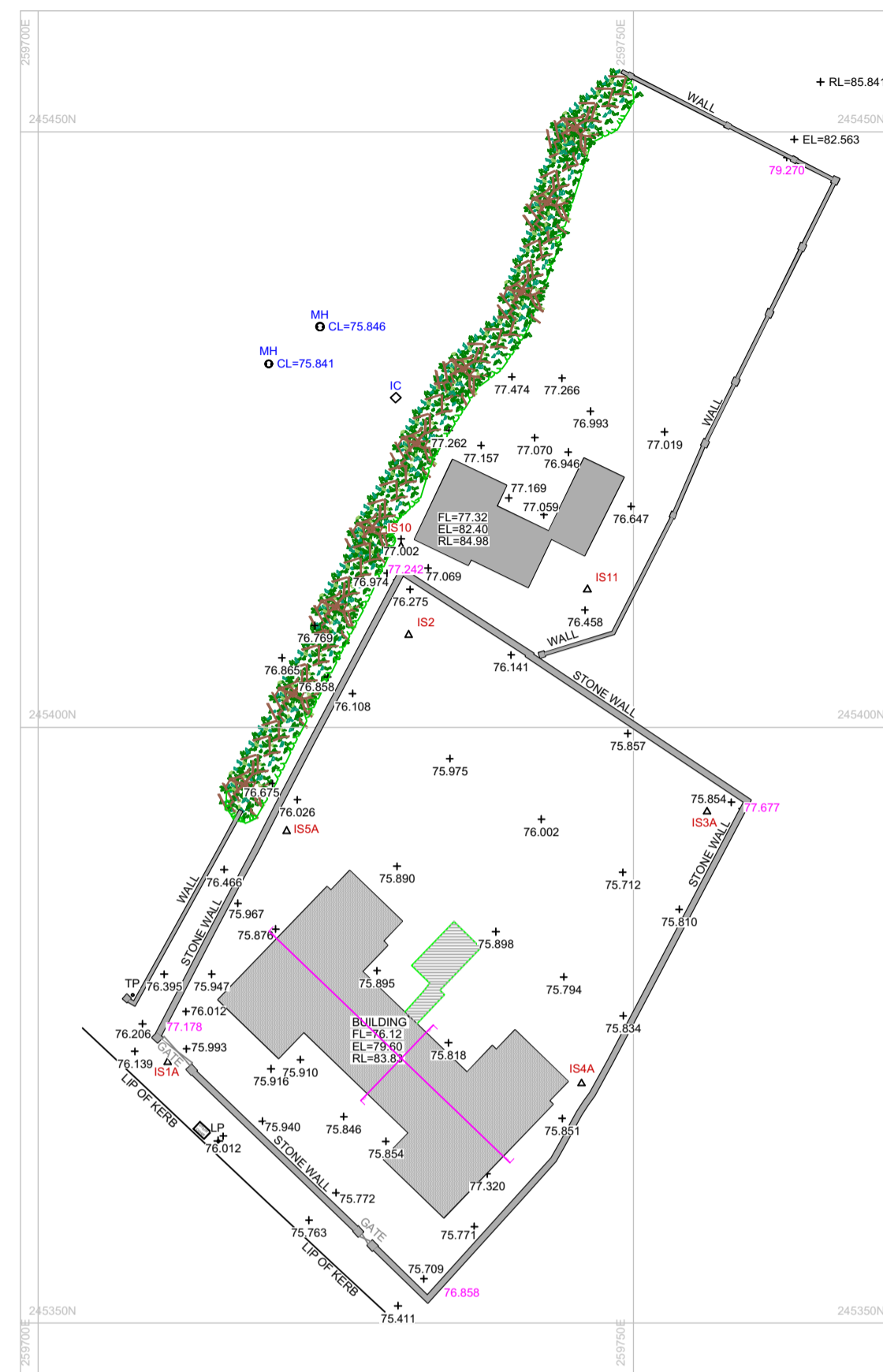
TOPOGRAPHICAL SURVEY SCALE 1:500