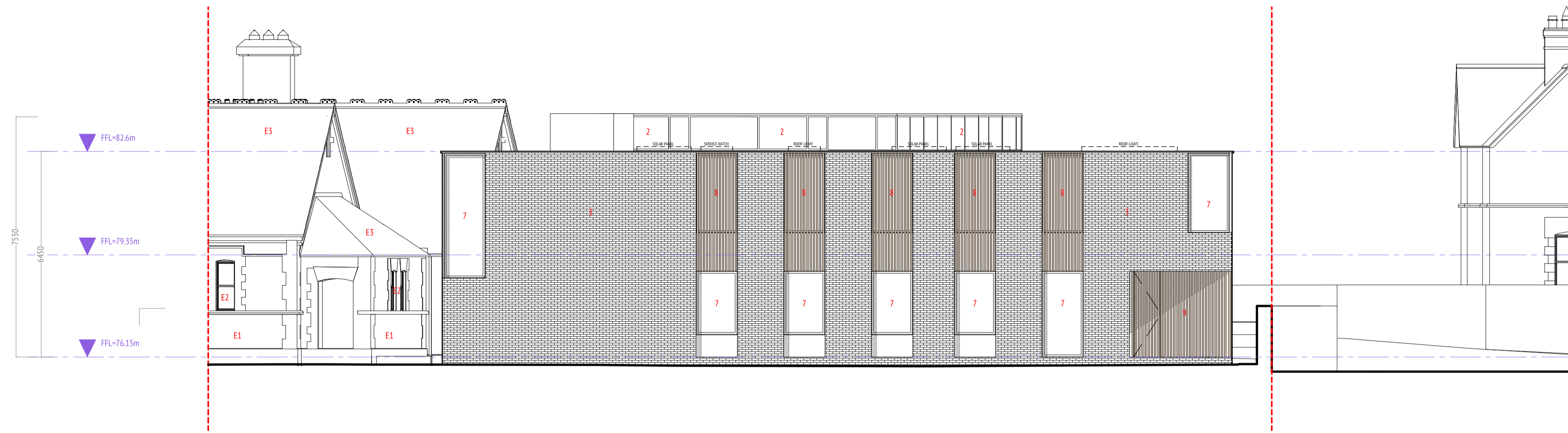
EASTERN ELEVATION SCALE 1:100