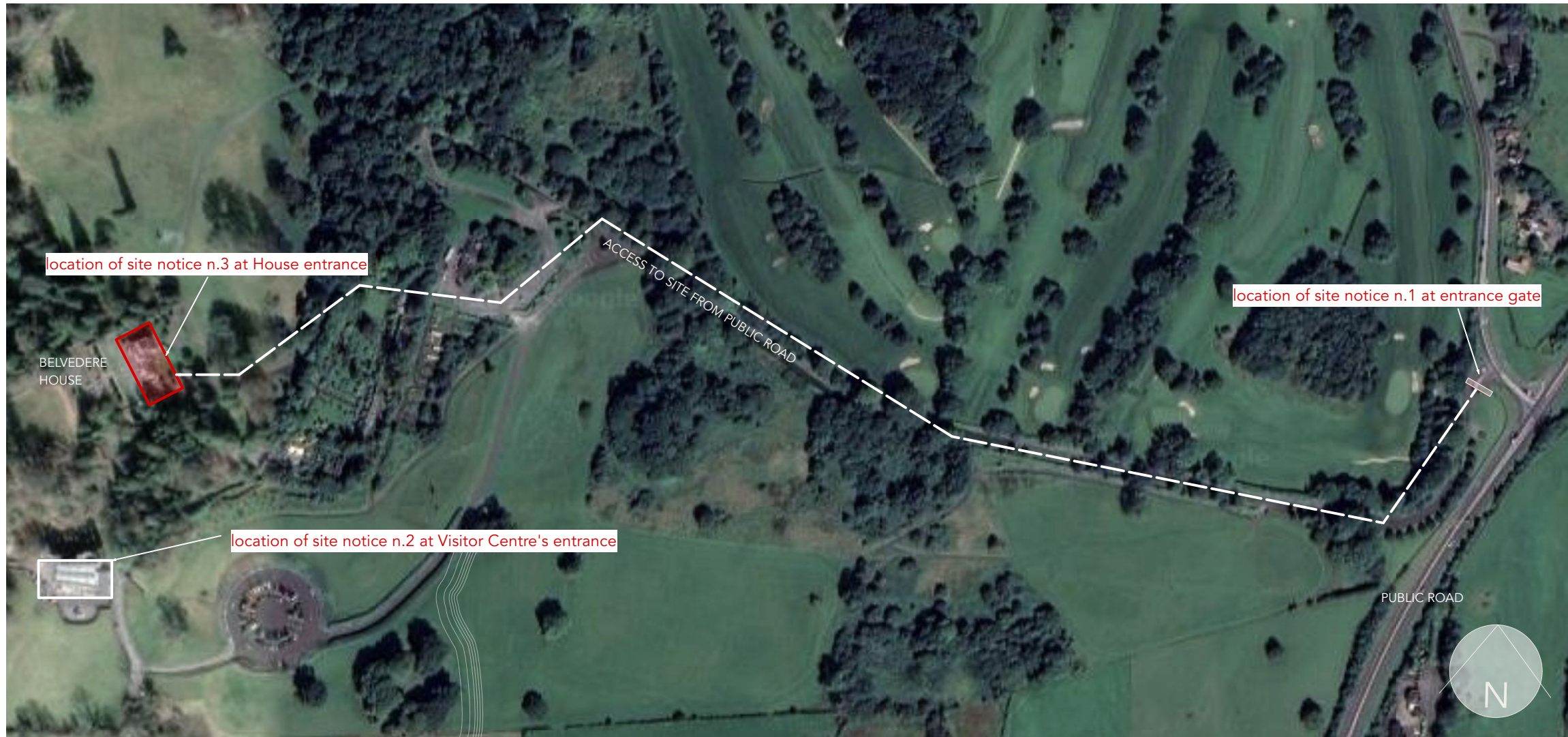
Site Notices location scale 1:2000