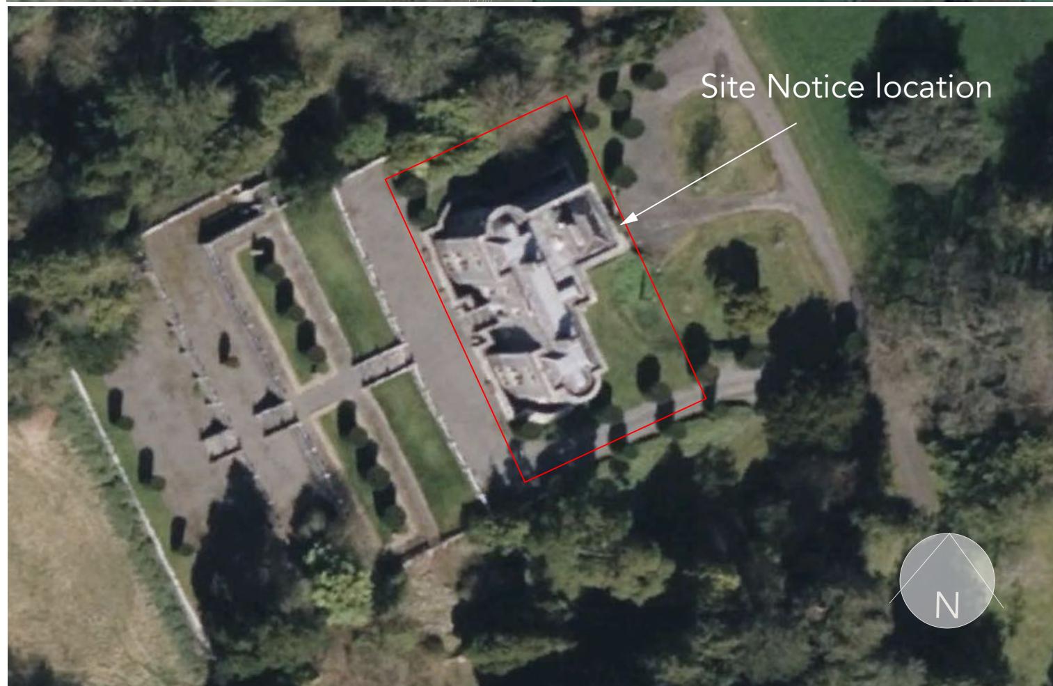
Site Plan - Belvedere House scale 1:500