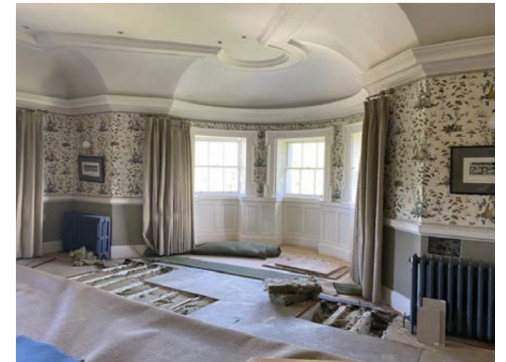
Images of existing window bay during opening up works