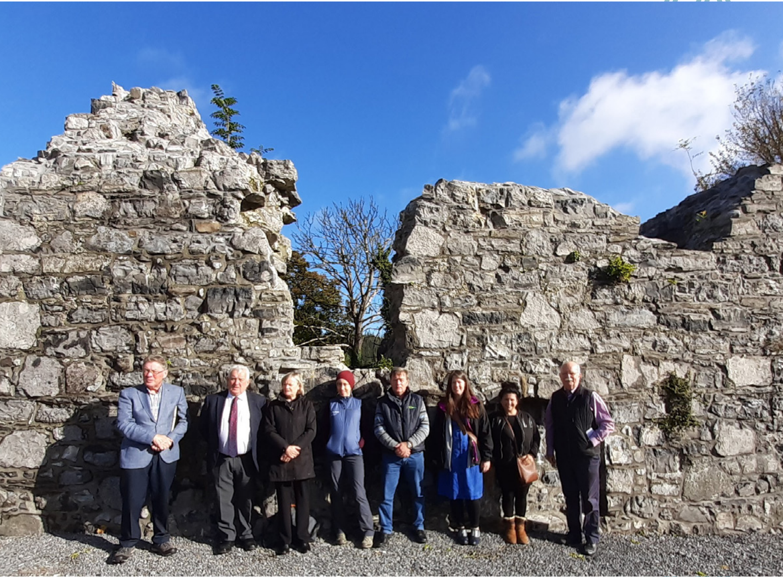
Some of the members of the Westmeath Heritage Forum at the Old Gaol in Fore, 2022