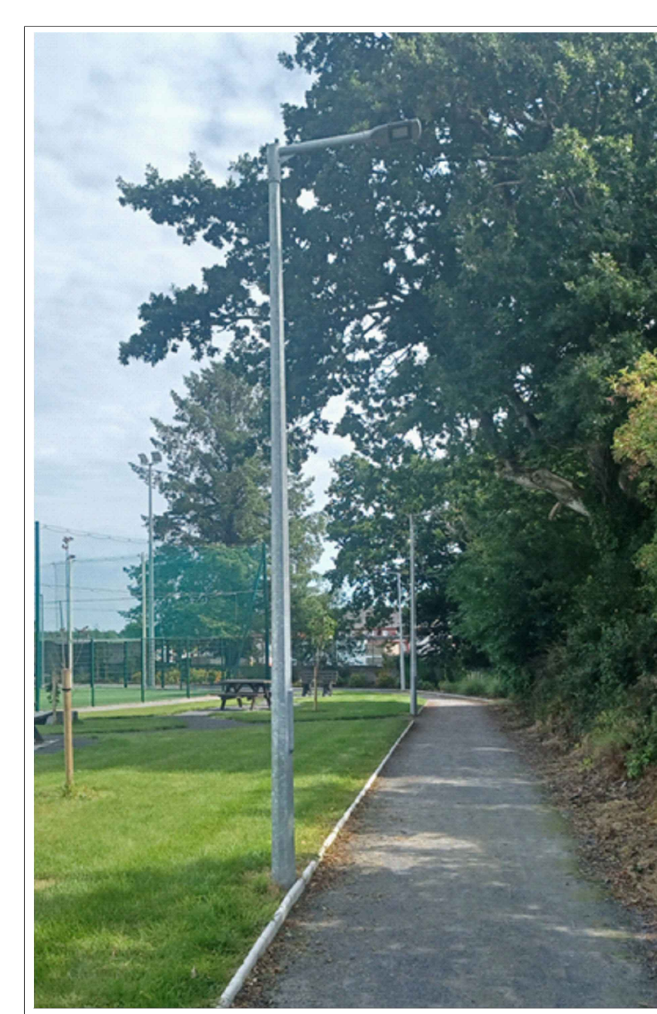
Typical Lighting Column (height varies) (Not to Scale)