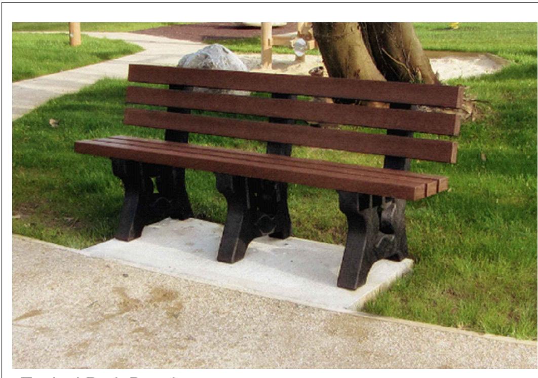
Typical Park Bench (Not to Scale)