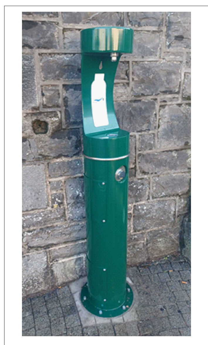
Typical Water Bottle Refill Point (Not to Scale)