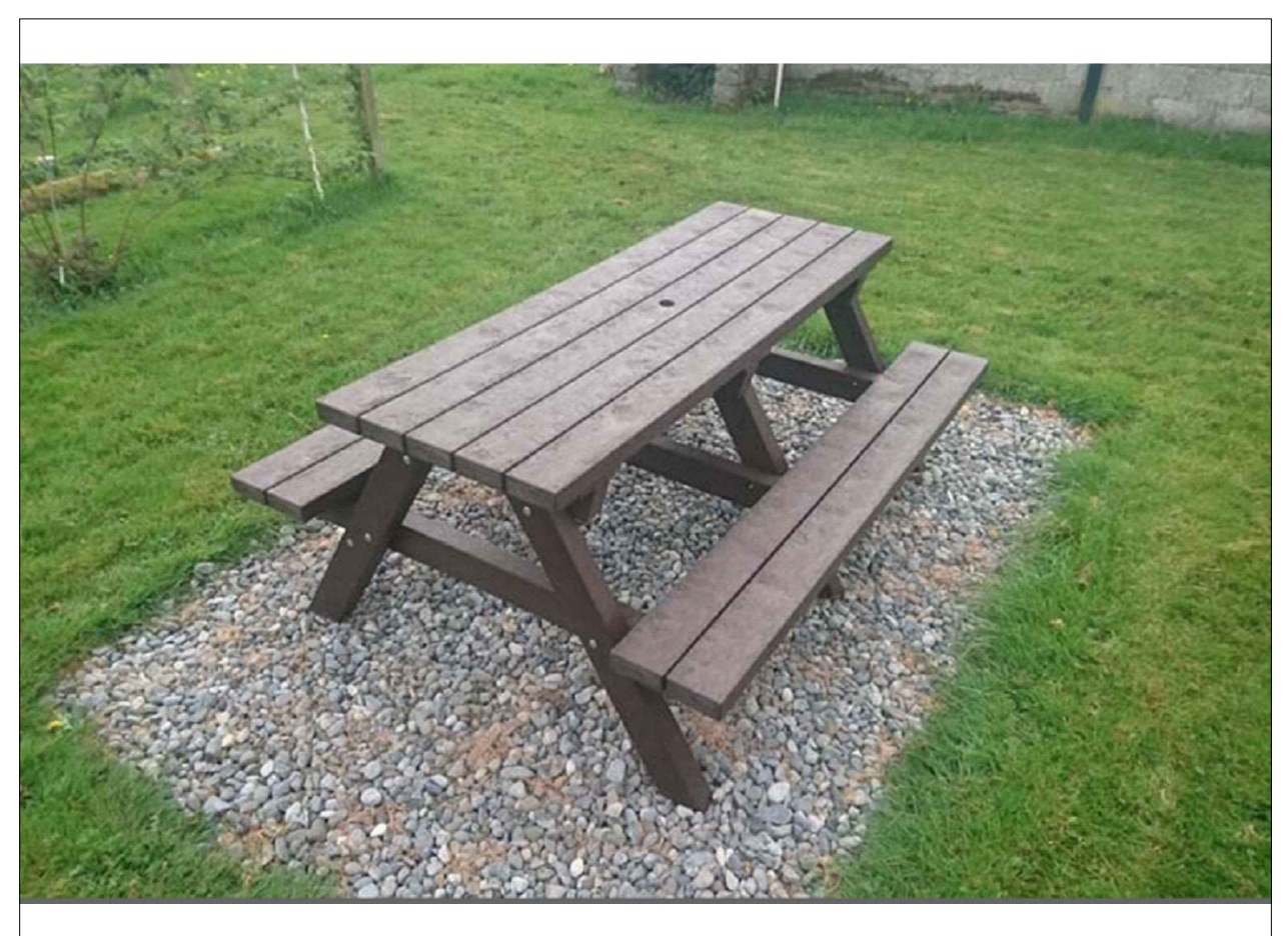
Typical Picnic Bench (Not to Scale)