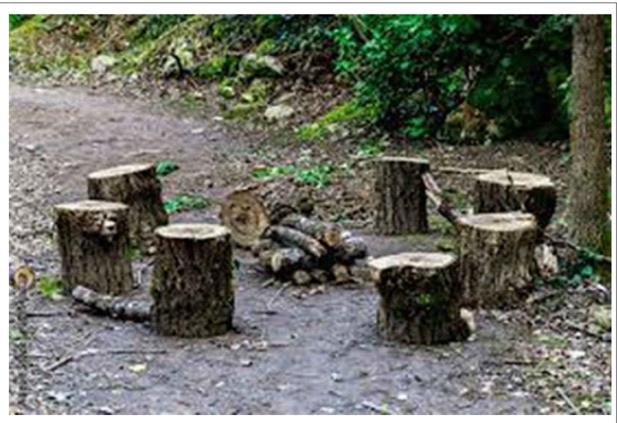
Typical Timber Stump Stools (Not to Scale)