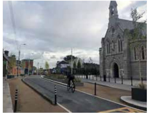
2. Traffic filtered street creating a quieter, safer, residential street

A number of interventions including signage, speed bumps, and carriageway narrowing could be employed to achieve this.