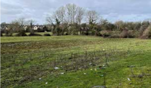
3. New Town Park A new park and rugby pitch with walking and cycling routes creating connections from Newtown and a walking and cycling loop.