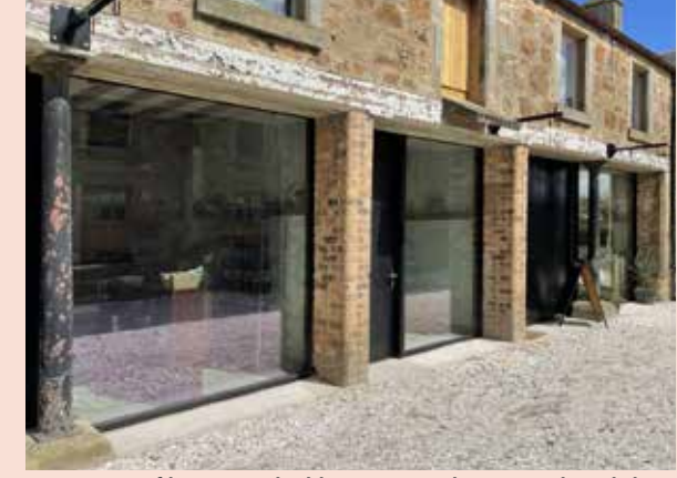
Conversion of historic outbuildings into workspace and workshops