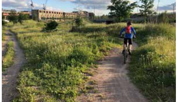
2. Pump track, BMX and skate park Providing activity and interest along the Greenway as well as opportunities for activities for young people and attracting visitors.