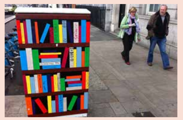
Utility box public art commission by Dublin City Council