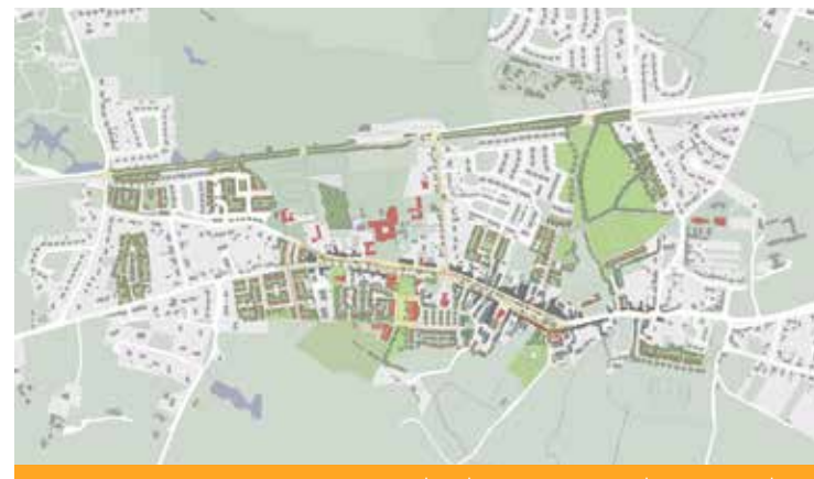
USES & ACTIVITIES PLAN looks at potential sites and development opportunities, re-use of existing buildings and possible activities.