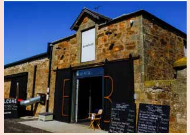
Conversion of historic outbuildings into food hub for small producers and businesses Bowhouse. Fife