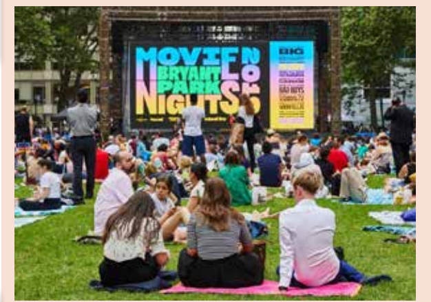
New civic green outside Tuar Ard space could provide opportunity for range of meanwhile uses including outdoor cinemas and play