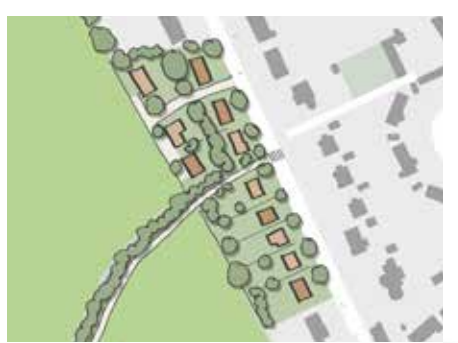
8. Infill housing opportunity

Potential for a new 'park terrace' and improved facilities for the Rugby Club to the south of the new park. A range of new houses creating a street overlooking the planned football pitch.