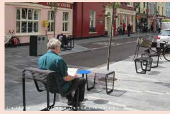
Clonakilty, Cork - reduced street clutter and high quality paving materials

While efforts have been made to provide a range of street furniture around the town, they are often in a poor state of repair or have been ill conceived in their placement. A coordinated and considered approach to be taken to future street furniture to ensure it is appropriately located to enable good accessibility, that it is simple in design, easy to use and to maintain, and that it makes a positive visual contribution to the streetscape.