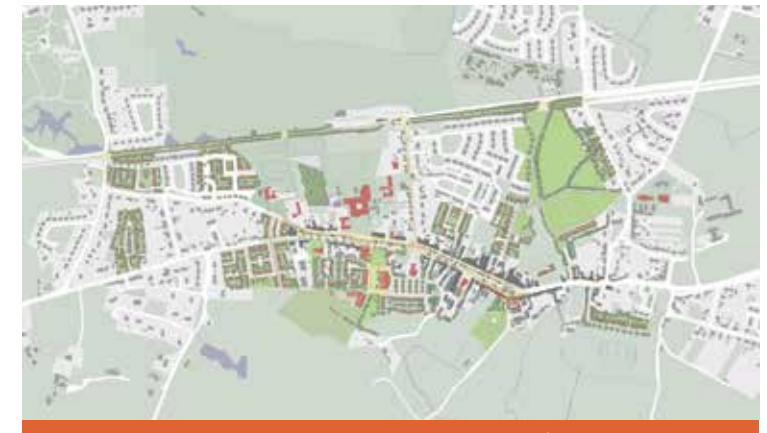
HERITAGE & IDENTITY PLAN sets out the opportunities for enhancing and celebrating the historic character, heritage and cultural assets of the town.