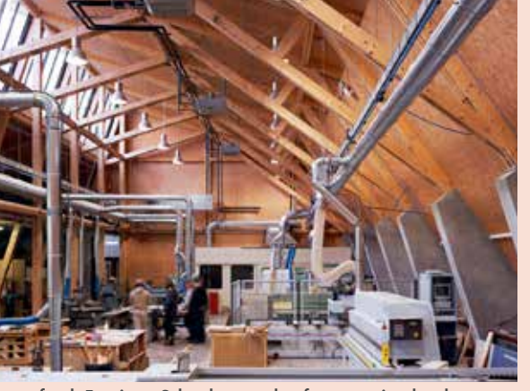
Letterfrack Furniture School example of community development company initiative Connemara West

Community feedback has indicated that Moate has a strong history of music and culture. The town already has a good range of venues and public spaces which could provide the opportunity for a town-wide festival celebrating its cultural offerings.