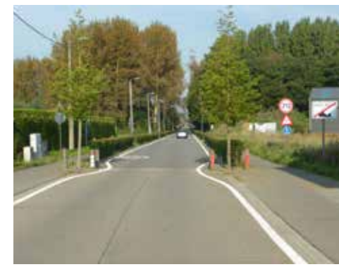
1. Traffic calming measures to reduce speed of vehicles approaching town

A number of interventions including signage, speed bumps, and carriageway narrowing could be employed to achieve this.