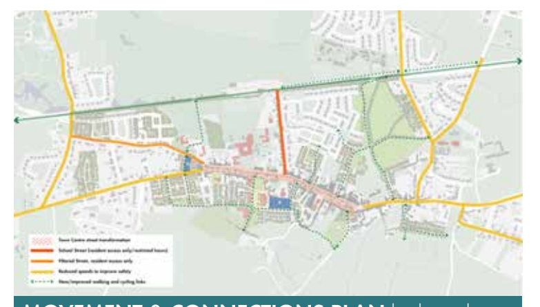
MOVEMENT & CONNECTIONS PLAN looks at the strategic road network and also includes ideas for better walking and cycling links, and parking.