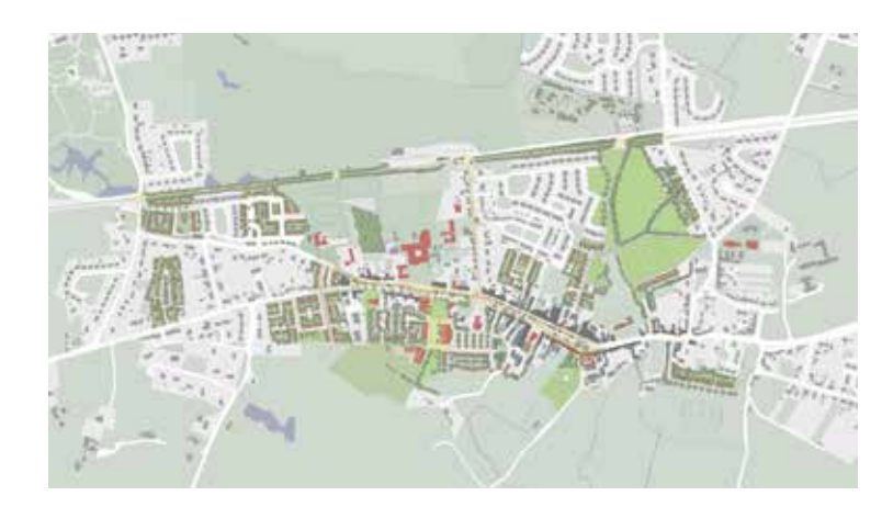
DRAFT FRAMEWORK PLAN sets out the big opportunities, including potential sites and opportunities for green spaces.