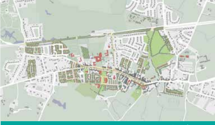
PUBLIC REALM & GREEN SPACES PLAN identifies opportunities for improvements to existing and formalised new green spaces, public spaces and routes.