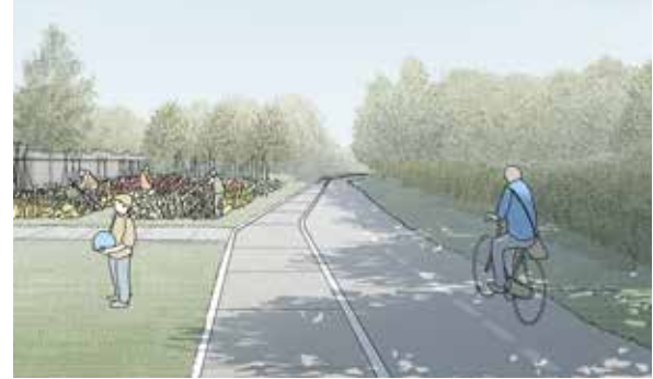
1. Enhancing the Greenway to form a Linear Park Including interactive and passive spaces, markers to identify the approach to Moate from bridges to the east and west, improved access, native planting, community growing opportunities, and views created over the landscape to the Castle.